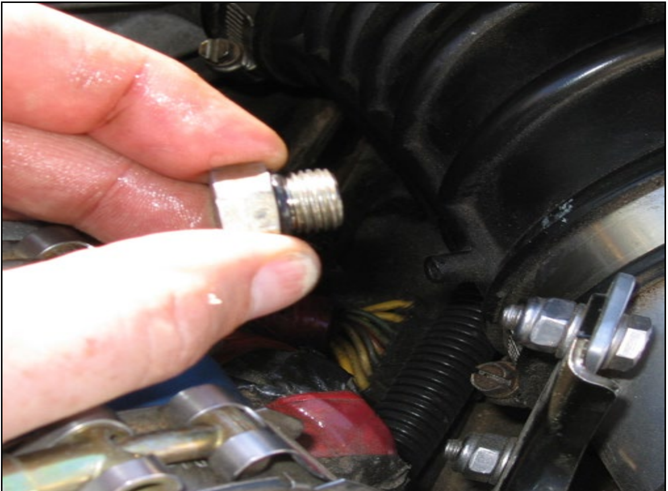
Figure 2 – High Pressure Oil Rail Plug Removed