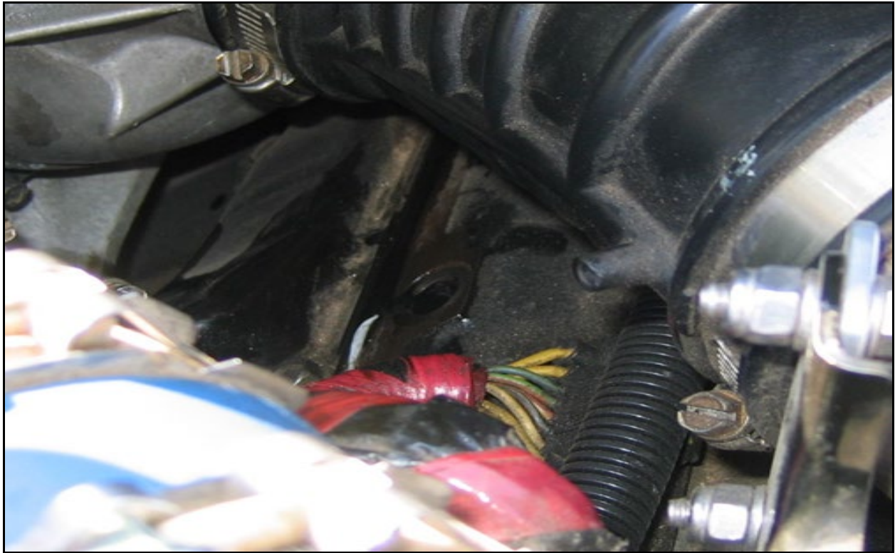
Figure 3 – Driver Side High Pressure Oil Rail Plug Removed