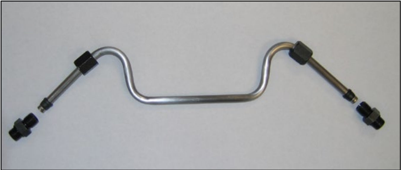
Figure 1 - HPX Tube Prepared for Installation